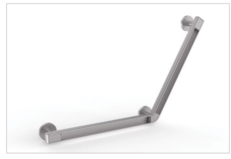
30 Degree Angled Grab Bar Finish: Brushed Nickel 16" | 01AN16BN 24" | 01AN24BN