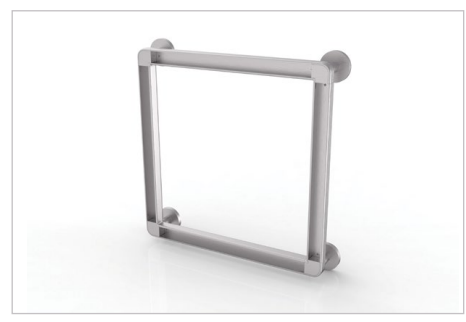
Square Bar Finish: Brushed Nickel 16" x 16" | 01SQ16BN 24" x 24" | 01SQ24BN