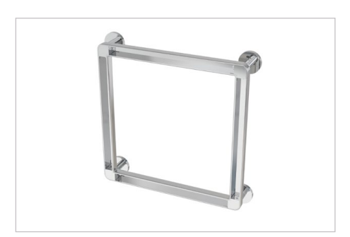
Square Bar Finish: Chrome 16" x 16" | 01SQ16PC 24" x 24" | 01SQ24PC