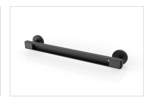
Straight Bar Finish: Matte Black 16" | 01ST16MB 24" | 01ST24MB