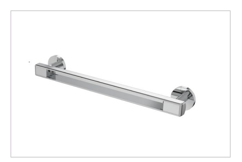
Straight Bar Finish: Chrome 16" | 01ST16PC 24" | 01ST24PC

Vibe offers a stunning array of three metal finishes, each tile-ready to give designers the freedom to customize look and finish with a surface inlay all their own. In parallel, LifeValet is preparing to introduce a range of elegant glass and metal inlays, each expertly crafted and exclusive to Vibe. No other grab bar offers this level of choice, or creativity.