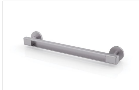
Straight Bar Finish: Brushed Nickel 16" | 01ST16BN 24" | 01ST24BN