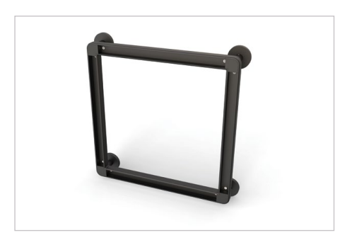
Square Bar Finish: Matte Black 16" x 16" | 01SQ16MB 24" x 24" | 01SQ24MB