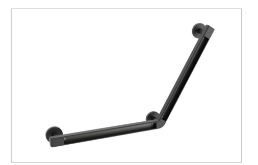
30 Degree Angled Grab Bar Finish: Matte Black 16" | 01AN16MB 24" | 01AN24MB