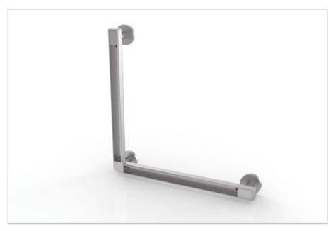
90 Degree L Grab Bar Finish: Brushed Nickel 16" x 16" | 01LS16BN 24" x 24" | 01LS24BN