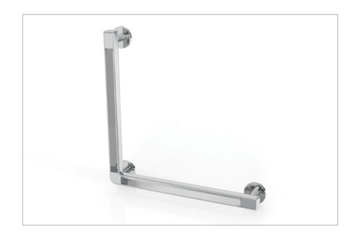
90 Degree L Grab Bar Finish: Chrome 16" x 16" | 01LS16PC 24" x 24" | 01LS24PC