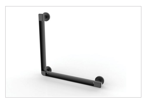
90 Degree L Grab Bar Finish: Matte Black 16" x 16" | 01LS16MB 24" x 24" | 01LS24MB