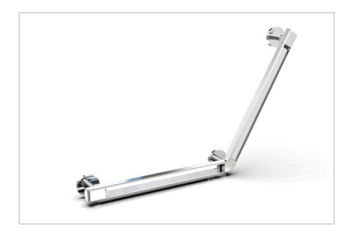
30 Degree Angled Grab Bar Finish: Chrome 16" | 01AN16PC 24" | 01AN24PC

Vibe's innovative modular design allows for customization beyond anything experienced before. Four stylish configurations, each available in two standard lengths with optional cornering hardware, easily connect to create any shape you can imagine, including unique and complex angles. Nothing is beyond possibility.